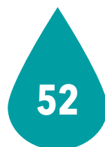
BAPTISMS IN 2017